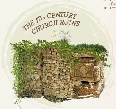
THE 17th CENTURY CHURCH RUINS